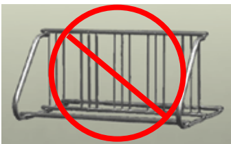
Grid or Fence Style Racks