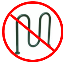
Wave or Ribbon Style racks