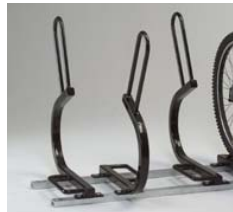
Madrax Sentry Rack