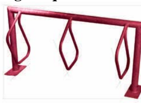
Dero Campus Rack