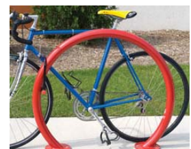
Inverted-U Type Racks