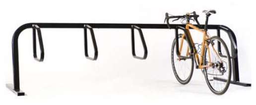
Saris City Rack