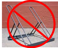
Racks that hold the bike by the wheel with no way to lock the frame and wheel to the rack with a U-lock