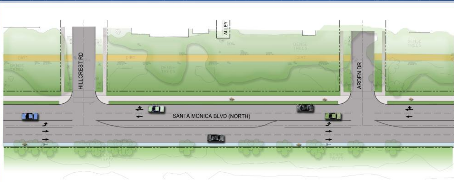
NORTH SANTA MONICA BLVD. - TYPICAL PLAN