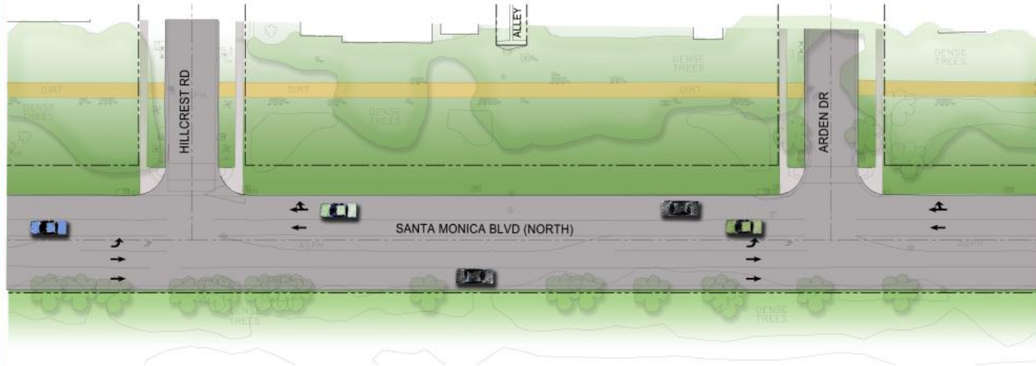
NORTH SANTA MONICA BLVD. - TYPICAL PLAN